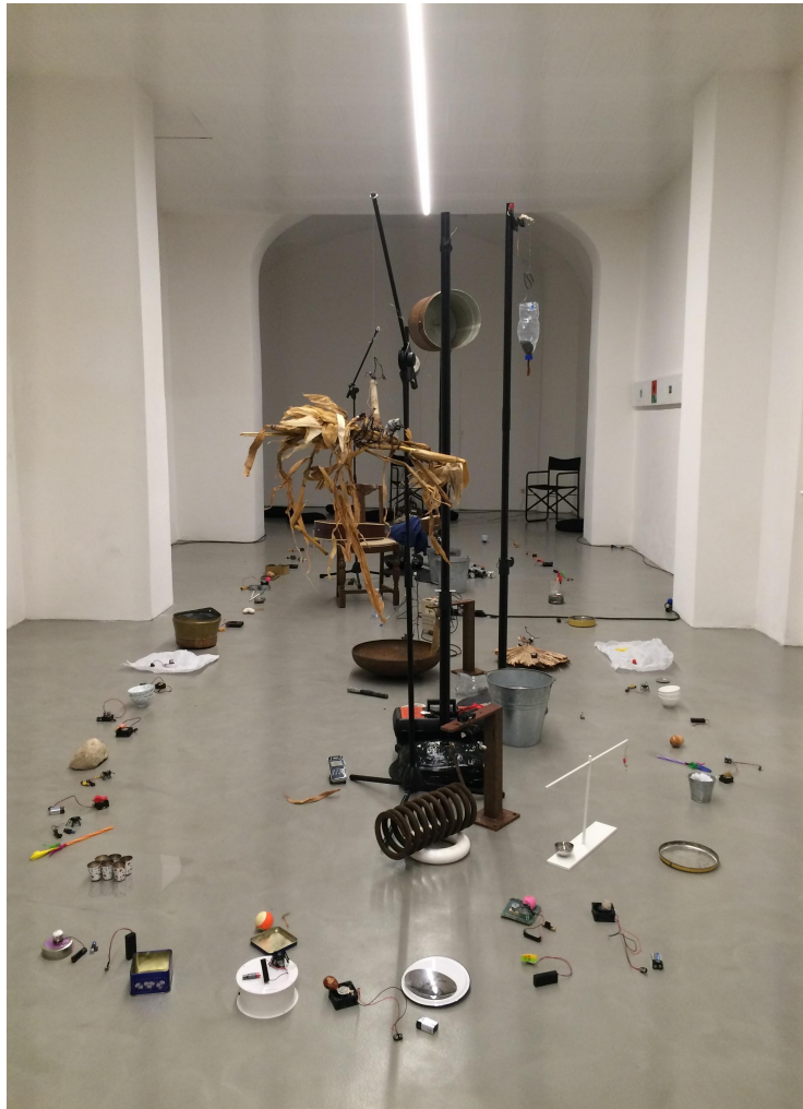
Firenze during our april 2016 tour, photo by Rie Nakajima

a link to Rie Nakajima's page: http://rienakajima.com