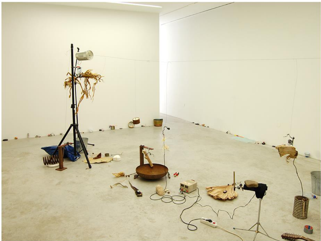
Ljubljana, during our april tour 2016, photo : Laszlo Juhasz